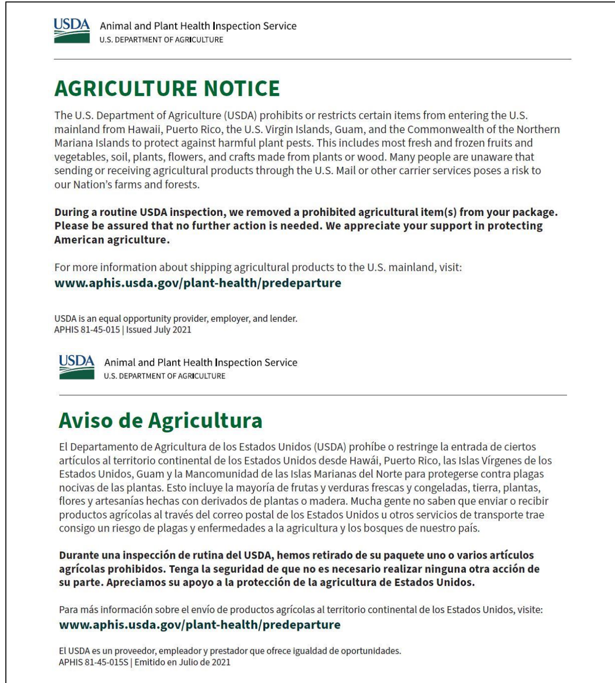
Figure A-9 Example of the Agriculture Notice

Issue an Agriculture Notice when a prohibited agricultural article is found and removed from a package. For ECO packages, place a copy of the Agriculture Notice in the package. For U.S. postal packages, place a copy of the completed PPQ Form 287, Mail Interception Notice and the Agriculture Notice in the package.