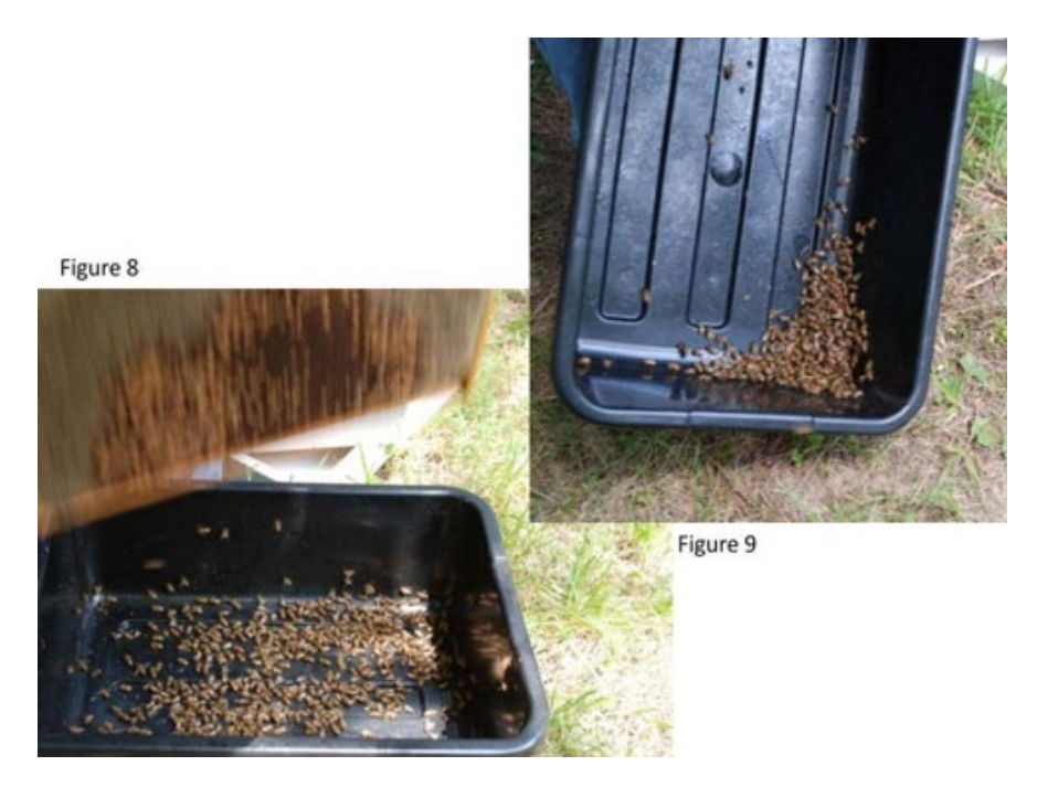
Figure 8: Shake bees from frame into wash tub. Figure 9: Knock bees into corner of tub to facilitate easy removal of ¼ cup samples of live adult bees.