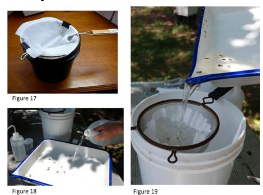
Figure 17: Secure cloth filter to the strainer using binder clips. Figure 18: Place water into metal collection pan to dislodge debris. Figure 19: Pour water and debris from metal collection pan through the cloth filter. Inspect the debris as you rinse for any signs of Tropilaelaps mites.