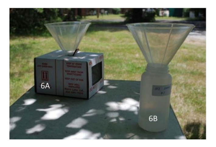
Figure 6A: Live bee shipping box with funnel inserted to receive bees. Figure 6B: Large bottle with funnel ready to receive bees.