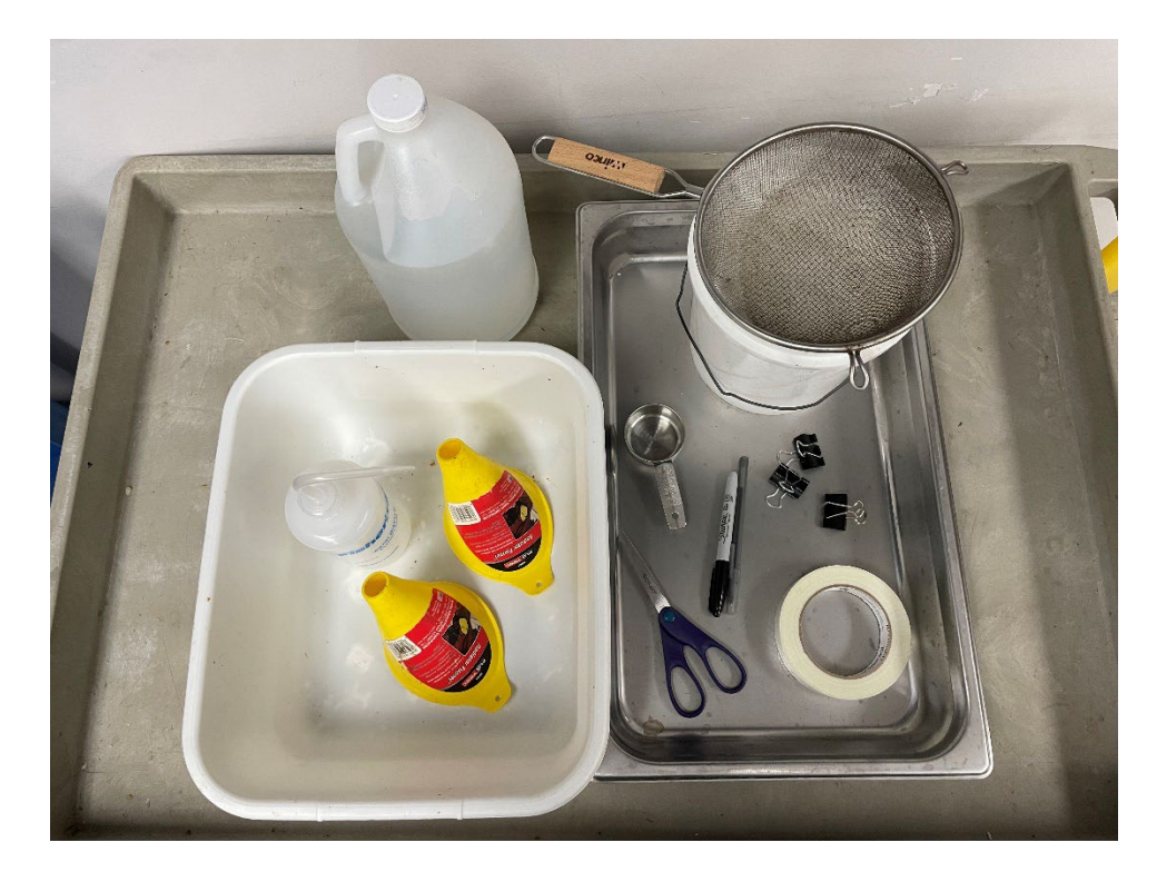
Figure 1: Reusable equipment needed for sampling apiaries (provided by the participating state or territory). Also needed are basic beekeeping protective equipment (e.g. coveralls, veil, etc.) and beekeeping tools (e.g. smoker, hive tool, etc.), which are not provided.