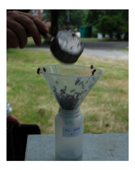
Figure 13: Place a second ¼ cup of bees into large bottle of alcohol.

Pro Tip: It may be helpful to put the lid from the 500 mL alcohol bottle over the opening of the funnel to reduce the risk of live bees escaping. This may also help you keep track of the lid.