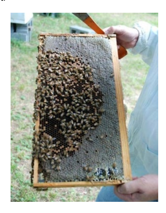
Figure 7: A frame containing sufficient adult bees, uncapped and capped brood for sampling.