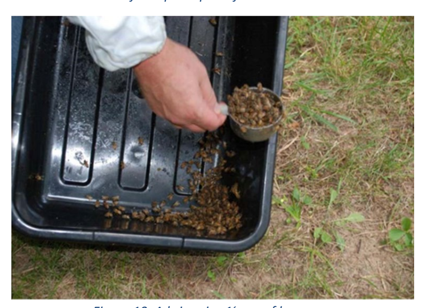
Figure 10: A brimming ¼ cup of bees.