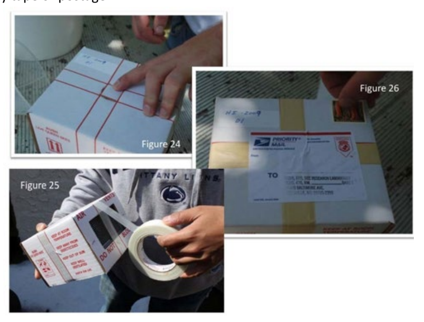
Figure 24: Secure the hole in the lid of the live bee shipping box with clear binding tape. Figure 25: Secure the lid of the live bee shipping box to the bottom of the box using the clear tape. Figure 26: Place pre-addressed shipping label (UMD Honey Bee Lab, College Park, MD) on the box. Clearly print "FROM" and your return address on the top left corner of the box. Make sure the identification number label is legible and securely attached to box. Mail the live bee shipping box, containing collected live bees, at the nearest Post Office ASAP.

Note: Please ensure that the sample label is clearly visible on the live bee box and is not covered by tape or postage.