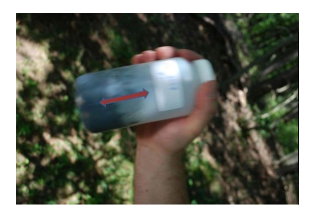
Figure 16: Close the large sampling bottle containing 2 cups of bees (1/4 cup from eight different colonies), tightly seal the lid of the container, and tip the bottle several times to ensure all bees are damp with alcohol.