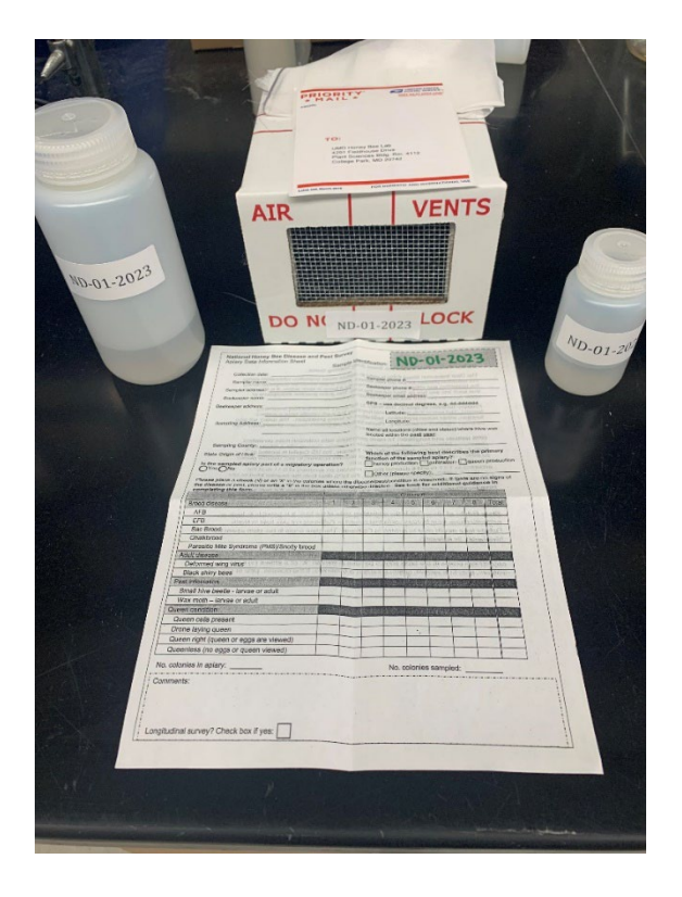
Figure 3: Place identification label onto data sheet, large bottle, small bottle, and mailing box.