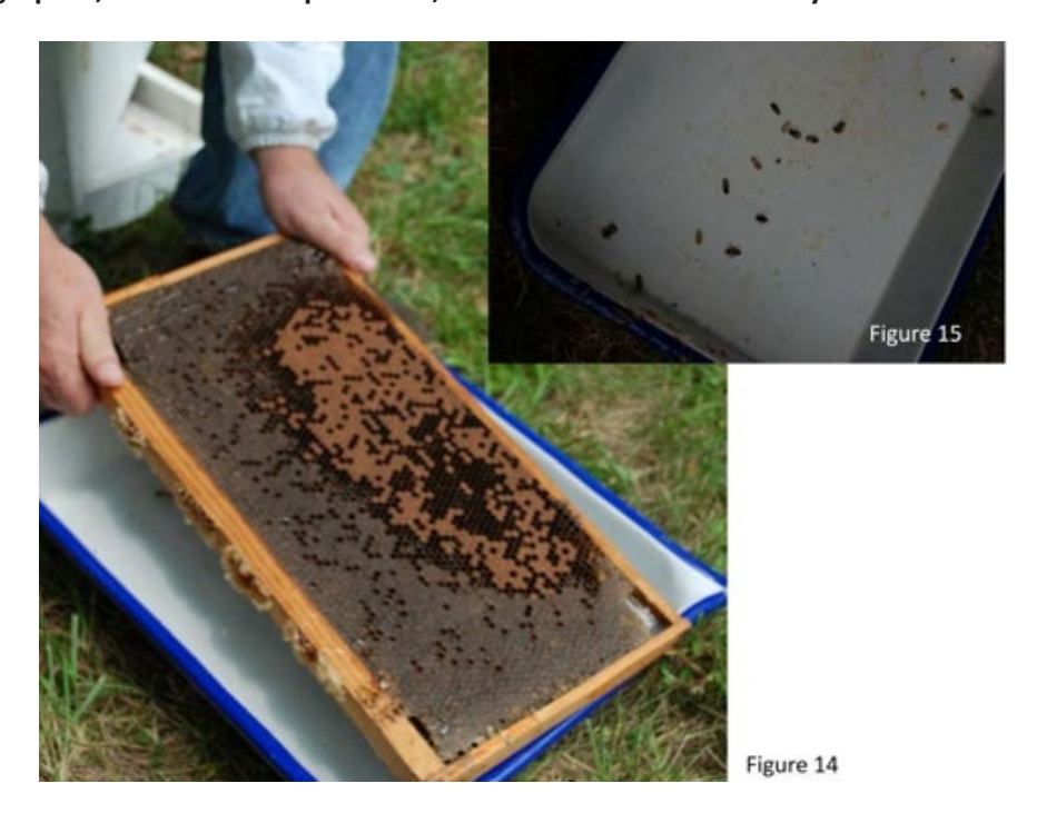
Figure 14: Firmly knock the frame over the metal collection pan by allowing one end bar to hit the metal collection pan. Figure 15: Debris dislodged from frames after being knocked in collection pan.