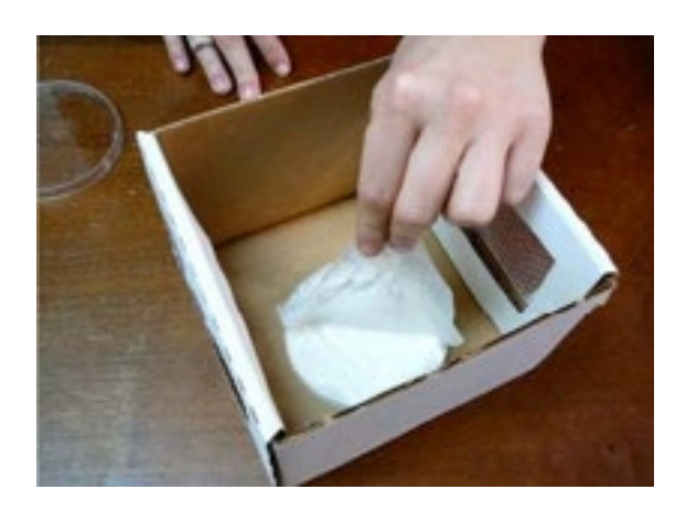
Figure 4: To ensure queen candy does not dry out before use, it has been sealed with wax paper in the petri dish. Remove and discard the petri dish cover and the wax paper before placing bees into the live shipping box.