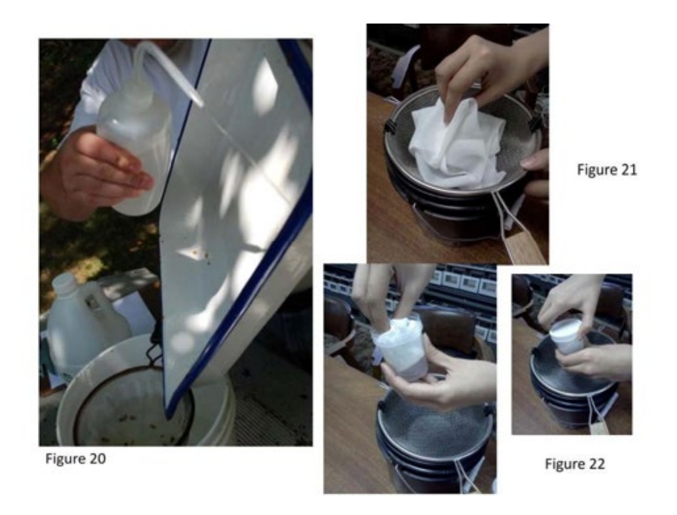
Figure 20: Using squeeze bottle, ensure last of debris in metal collection pan is filtered through cloth filter.