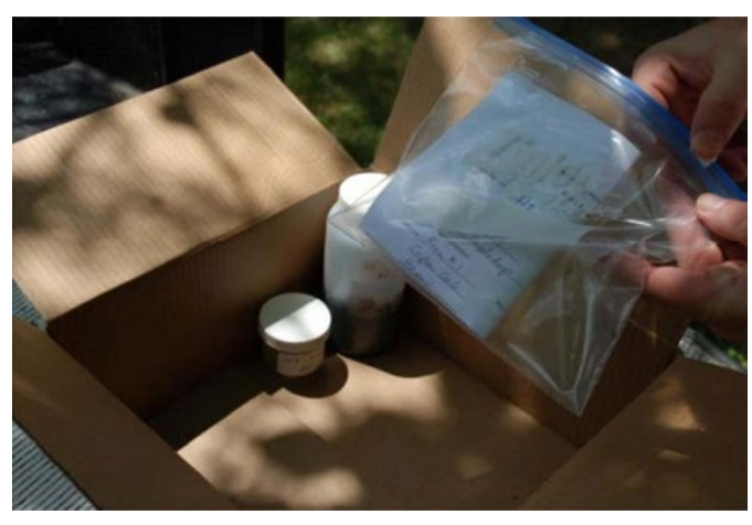
Figure 23: After ensuring the data sheet has been filled out completely, and after making a copy of this sheet for your records, place it in its own Ziplock bag and place this Ziplock in the prepaid mailing box containing the sample bottles. (Note: Do not put the data sheets in the same Ziplock bag as the sample bottles, as the bottles may leak and make the writing illegible.) When ready to ship samples, double check all lids are securely fastened, put the sample bottles in Ziplock bags and add packing material (e.g., newspaper), if necessary, so bottles are not damaged during shipment. Add sealed Ziplock bag with data sheets and seal box with binding tape.

26. Double check the lids of the small and large collections to make sure they are tight. Place both the small (containing the cloth filter) and large bottle (containing bees) into large Ziplock bags to contain any leaks from the alcohol before placing them into the large Priority Mail flat rate box. The samples should be mailed as soon as possible so they can be examined for invasive threats to U.S. honey bees. Prior to mailing, place one of the pre-addressed shipping labels (UMD Honey Bee Lab, 4291 Fieldhouse Drive, Plant Sciences Building Room 4112, College Park, MD 20742) at the appropriate place on the box. Write "FROM" and your return address on the upper left corner of the box.