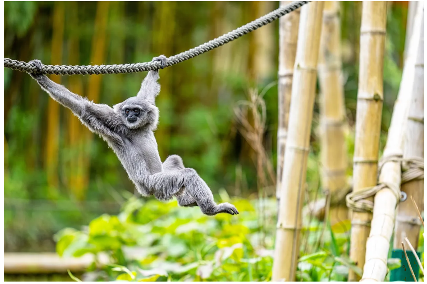
Other Animal Care Documents

These documents contain additional reference information that may be useful to our regulated community.