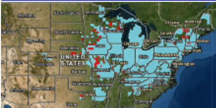
Imported Fire Ants Quarantine Map