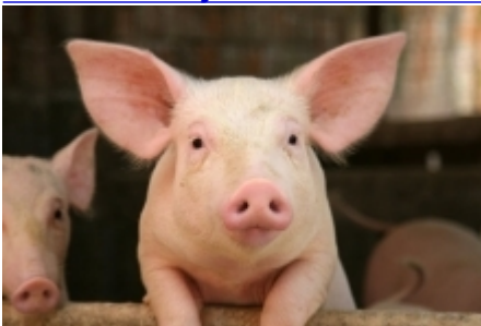
Swine Study Part 2 Dashboard