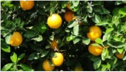
Citrus Disease Story Map