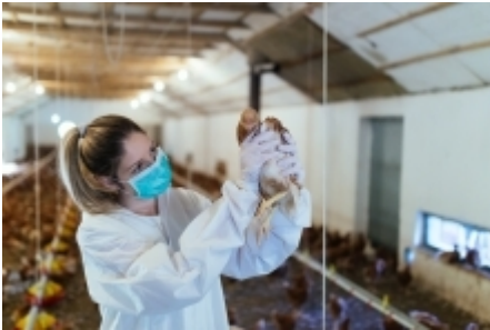
HPAI Wild Bird Dashboard