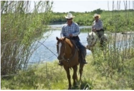
Equine Arbovirus Dashboard