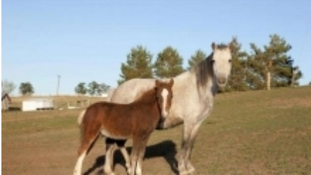
Federally Approved Livestock Markets Dashboard