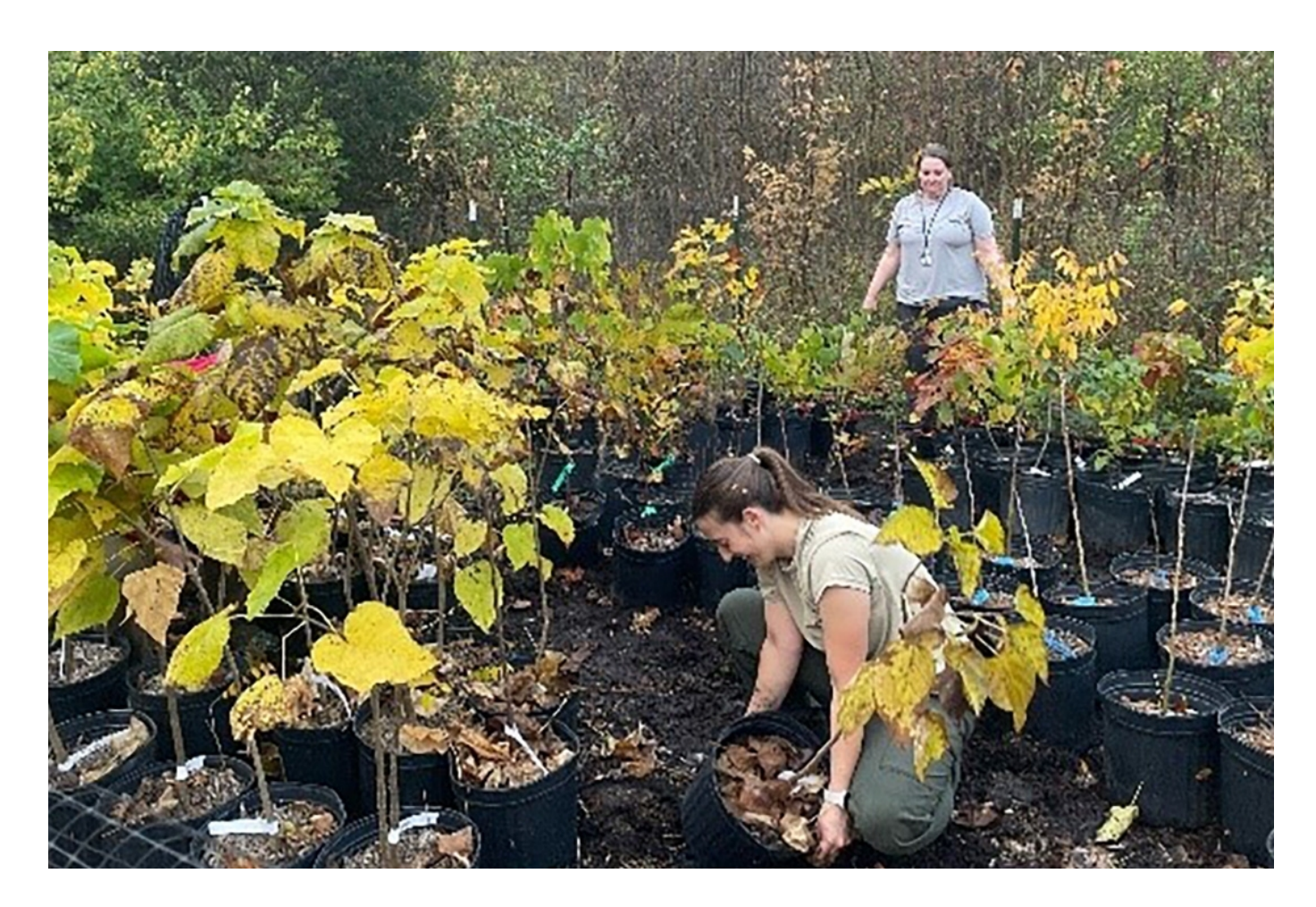
Want more stories? Check out our archives!