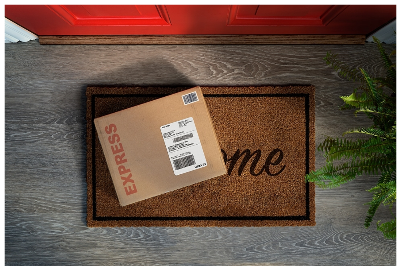
Ohio Asian Longhorned Beetle Eradication Program Gifts Residents Free Trees

Clermont County residents have been heavily impacted by the ALB, which kills trees it attacks and caused the removal of over 96,000 trees. APHIS ALB employees saw an opportunity to make a difference and started a Tree Giveaway Program.