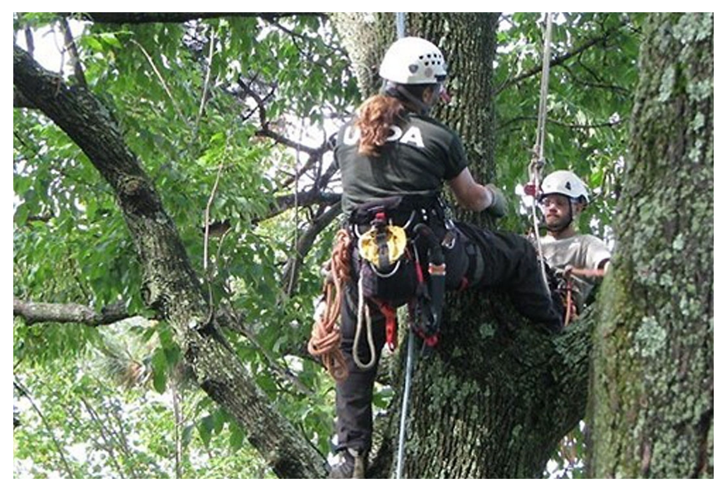
Victory Over the World's Largest Hornet Species

After five years of relentless effort, the northern giant hornet ( Vespa mandarinia ) has been eradicated from Washington State and the United States.