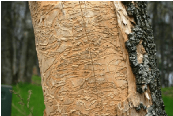
Larva Damage (S-shape)