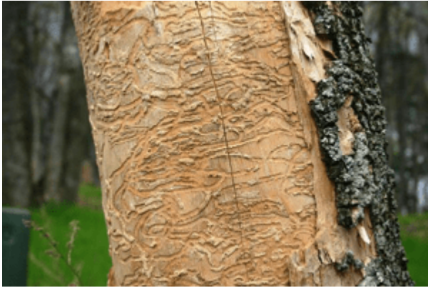
Larva Damage (S-shape)