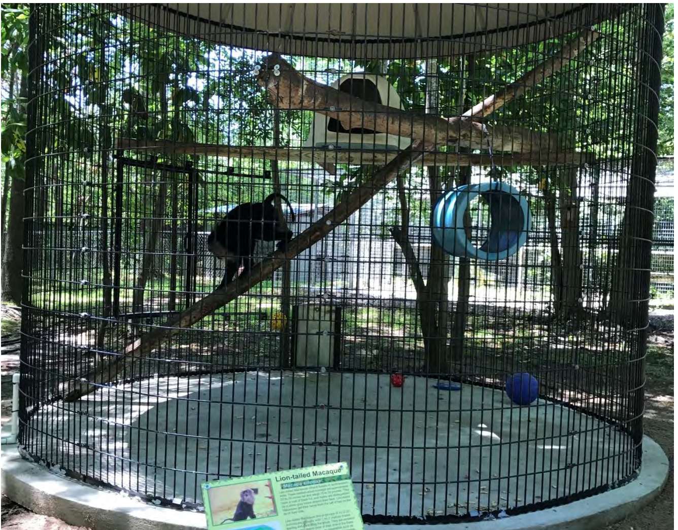
Photo 6: A lion-tailed macaque held in solitary confinement (May 14, 2017)