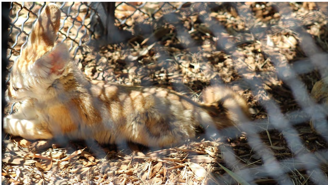
Photo 2: A fennec fox with hair loss on the left thigh (May 14, 2017)