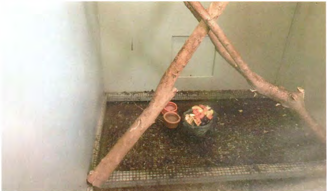
Photo 6: Unsanitary conditions in the enclosure confining cotton-top tamarins