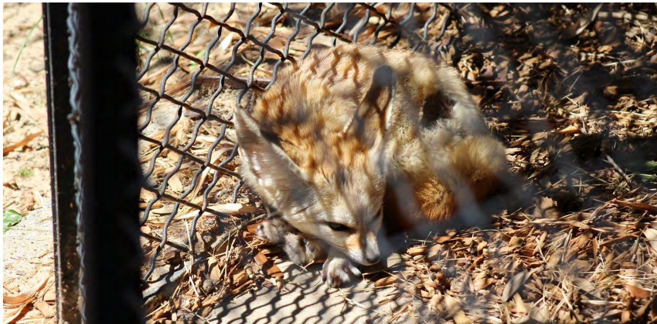
Photo 1: A fennec fox with hair loss on the left thigh (May 14, 2017)