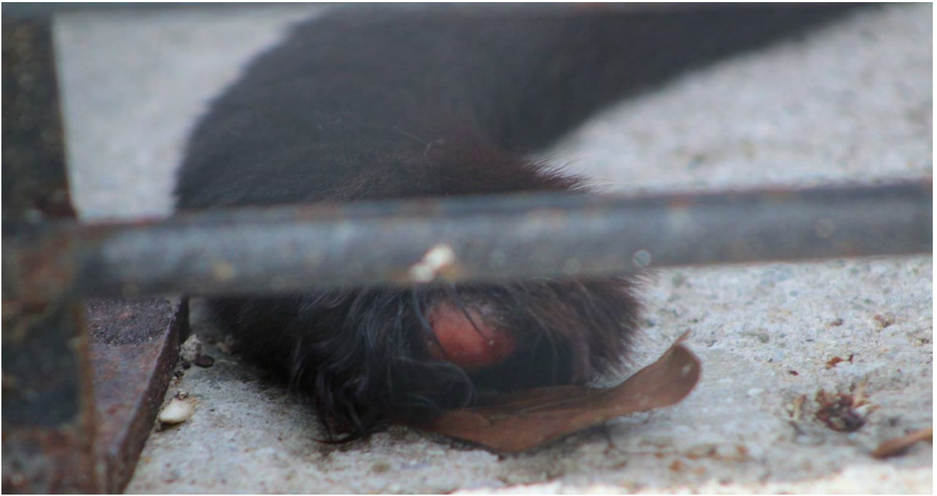
Photo 3: A leopard's tail with hair loss and red skin (April 8, 2017)