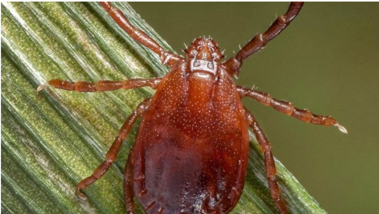
Adult female Asian longhorned tick on a plant stem

Asian longhorned ticks ( Haemaphysalis longicornis ) are invasive pests that pose a serious threat to livestock in the United States. They can form large infestations on one animal and spread diseases that impact both animals and people.