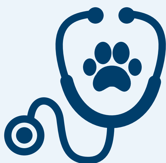
Veterinarian (0701 series)