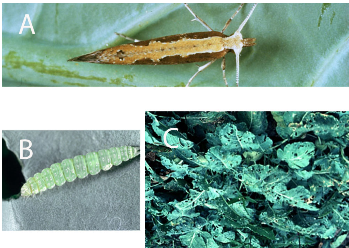
Figure 3. Diamondback moth adult (A), larvae (B), and damage on a cruciferous crop from diamondback moth larvae.

Individual images derived from Cornell University (n.d.-a).