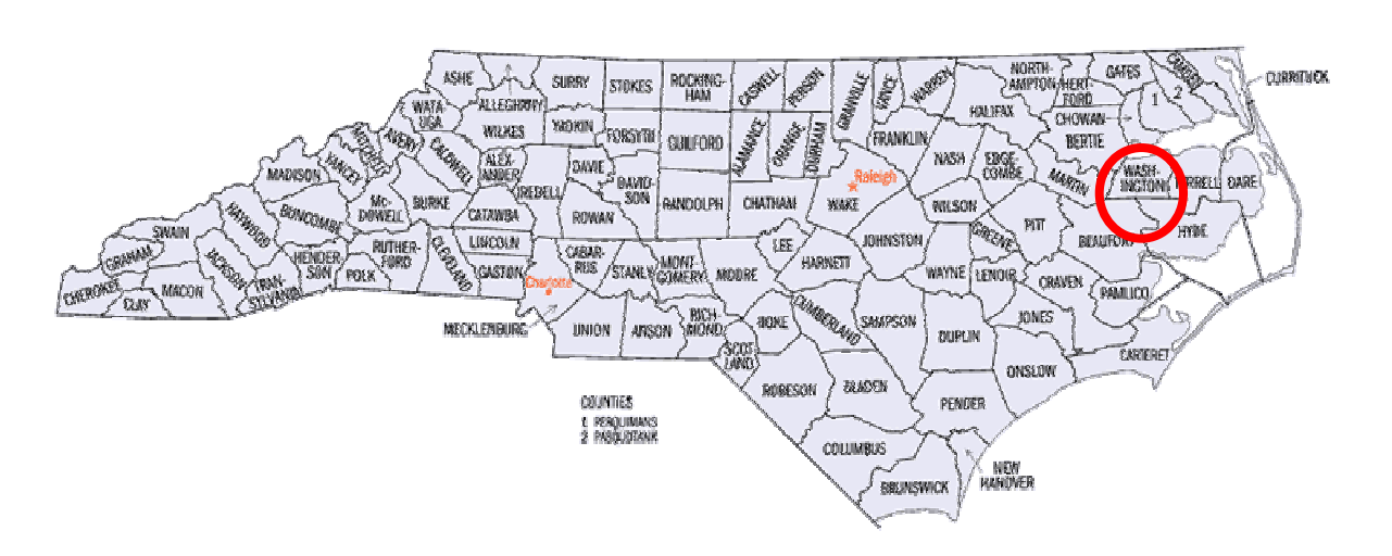
Figure 2. Counties, North Carolina. Washington County is in the north-eastern part of the state.

FEDERAL summary page for North Carolina,: <a href="http://ecos.fws.gov/tess_public/TESSWebpageUsaLists?state=NC">http://ecos.fws.gov/tess_public/TESSWebpageUsaLists?state=NC</a> Accessed March, 2005