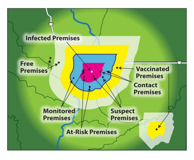
Zones and Areas