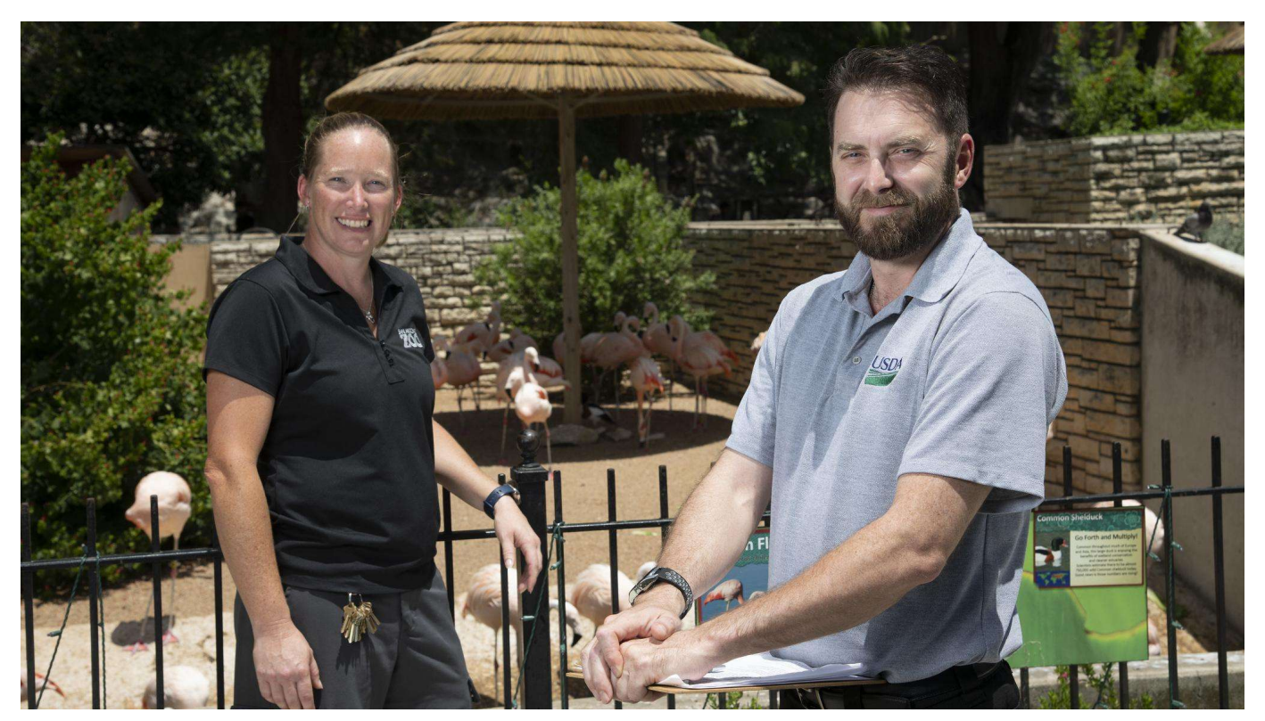
Biotechnology Regulatory Services

Protects agricultural and natural resources by ensuring safe development of genetically engineered organisms using a science-based regulatory framework.