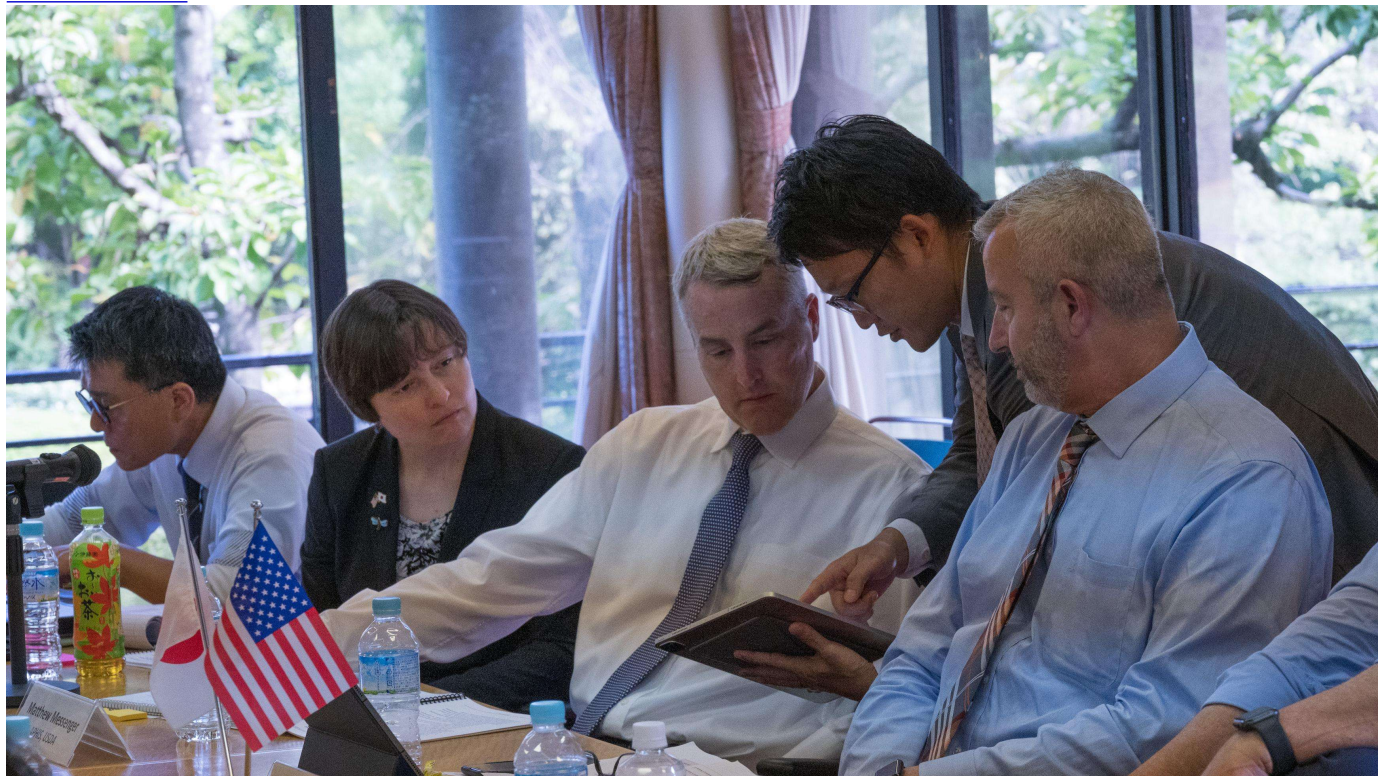
Plant Protection and Quarantine

Safeguards agriculture and natural resources from risks associated with the entry, establishment, or spread of pests and noxious weeds.