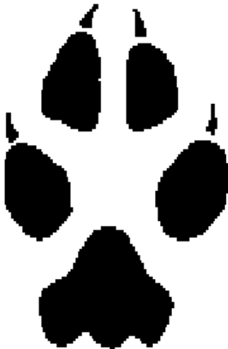
coyote track shown actual size - 3

ACTIVITY: On the map above, label the countries where coyotes live.