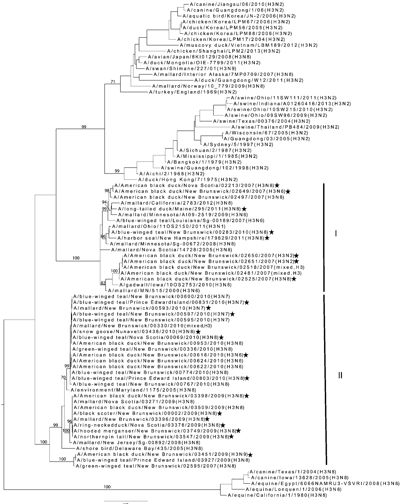
Fig. 1. Phylogenetic analysis of HA genes of H3 IAV isolates from migratory waterfowl in North America (2007–2011). The H3 IAV isolates included in antigenic characterization are marked with a star. The phylogenetic analyses were performed using maximum likelihood by the GARLI version (5), and bootstrap resampling analyses were conducted using PAUP* 4.0 Beta (52) with a neighbor-joining method, as previously described (6).