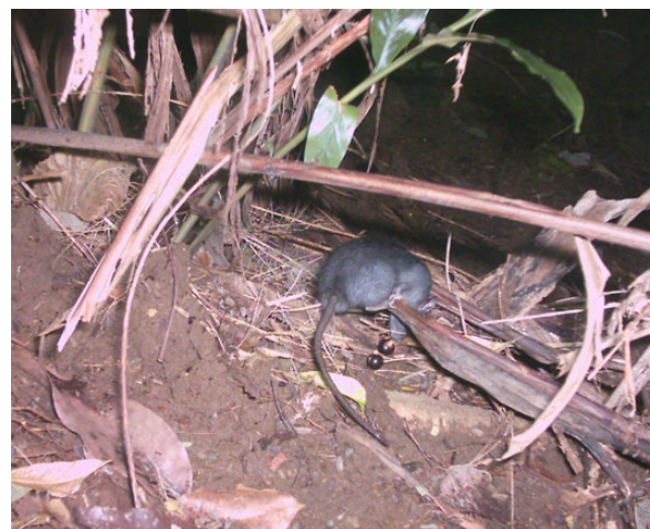
Figure 2. Photograph taken by a motion-sensing camera depicting R. rattus removing fruit (and seed) of P. hillebrandii from an OPEN station, in Hawai'i wet forest (Lyon Arboretum). One characteristic that identifies the photographed rat as R. rattus is the very long tail (longer than the body; see Shiels et al. 2014).