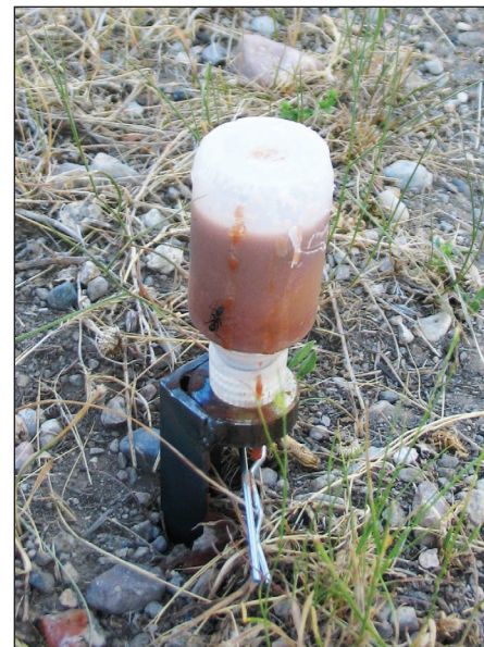
Figure 1. Coyote Lure Operative Device containing the theobromine-caffeine mixture that has been chewed on by a coyote.

of an accidental dosing. Therefore, Rhodamine B was added (0.04 percent wet weight) to the same mixture as described for Trial 1. The use of Rhodamine B would act as a marker (Evans and Griffith 1973, Marsh et al. 1982) by making the animals lips turn red upon exposure signaling to a pet owner that their animal had ingested something unusual, and thereby allowing a pet owner to get the pet to a veterinarian for treatment. Corn syrup was applied liberally to the outside of the CLOD to encourage the coyote to lick and chew the CLOD. Trial 2 was conducted in a 6-ha pen with one CLOD placed in the pen.