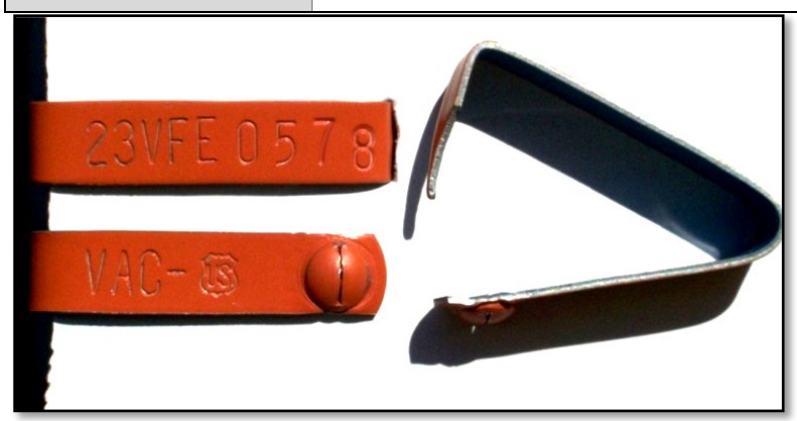
Table 4. National Uniform Eartagging System – NUES Tag