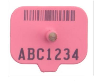
Inside of Tag Piece B 2 (Not in View while tags is on the pig)