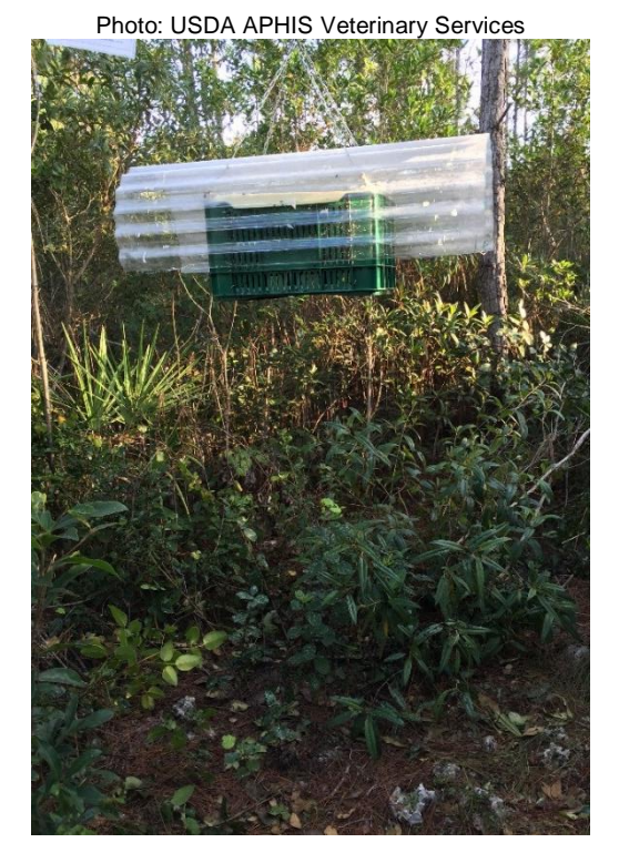
Figure 3. Release Container Used in the Florida Keys, 2016–2017

emergence of the flies can be delayed for a few days by chilling the pupae to 50^{\circ} F (10 ° C) in a refrigerated room, a walk-in cooler, or a refrigerated tractor-trailer.