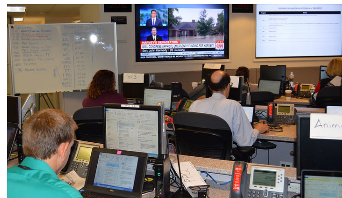
USDA APHIS staff in the APHIS Emergency Operations Center coordinate resources and information to support Hurricane Harvey relief efforts.

Reinforce animal and plant health emergency frameworks. APHIS has established, and will continue to review and update as needed, animal and plant health emergency frameworks to facilitate coordinated, timely responses to disease and pest emergencies. APHIS also has established frameworks to respond to extreme weather events (e.g., hurricanes, floods, wildfires), which may impact plant and animal health and prompt needs for technical assistance with agriculture emergency management. APHIS will coordinate assistance from other USDA and DHS emergency response resources in the event of wide-range climatic disruption events to bolster our response in the event that APHIS capacity is limited. Additionally, changes in pest and disease biology will require APHIS to ensure that its emergency response strategies (including new pest and disease response guidelines) and capabilities are updated.