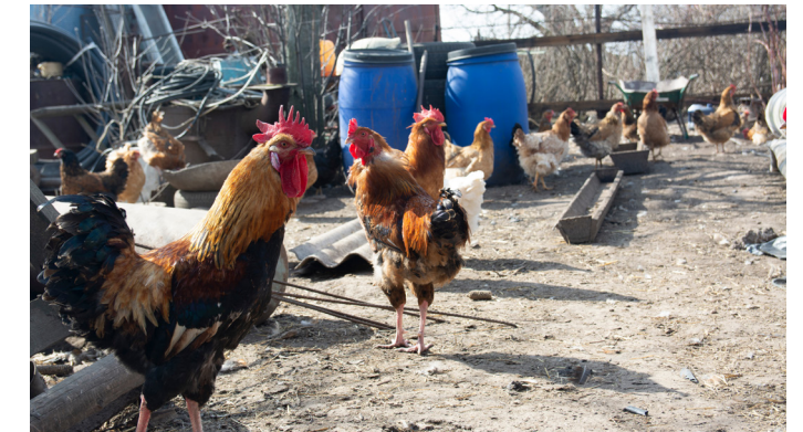
Many people now keep backyard poultry. Good bio-security practices are imperative for managing disease impacts.

APHIS recognizes that those in underserved communities are particularly vulnerable to extreme weather events due to a greater direct dependency on agriculture, forestry, and outdoor recreation for income and employment. These communities may have existing challenges with infrastructure and connectivity and limited capacity to prepare and respond to extreme events, likely leading to long-lasting shifts in community structure and composition. To address some of the current and future needs, APHIS proposes taking actions to better identify (1) underserved communities and specific issues within those communities related to climate change and (2) opportunities to support and encourage (via funding programs, guidance, etc.) more climate-resilient investments in communities.