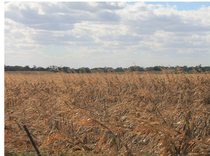
Derecho damage to crops in Story, Marshall and Tama Counties in Iowa, September 2020.