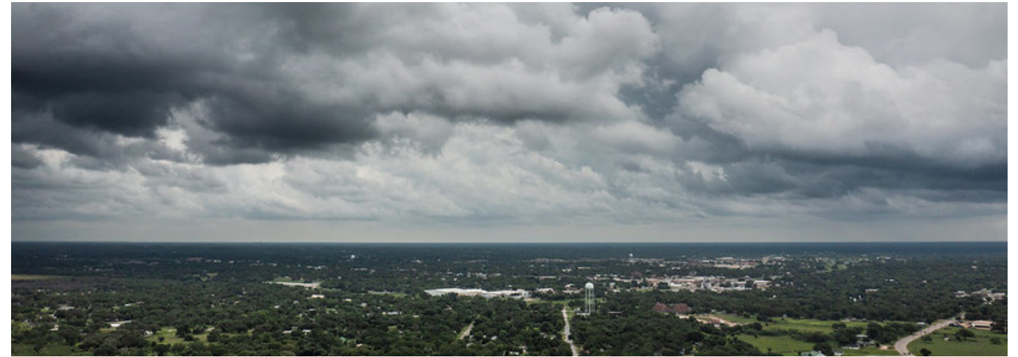
Thunderstorm near Cuero, TX on June 3, 2021.