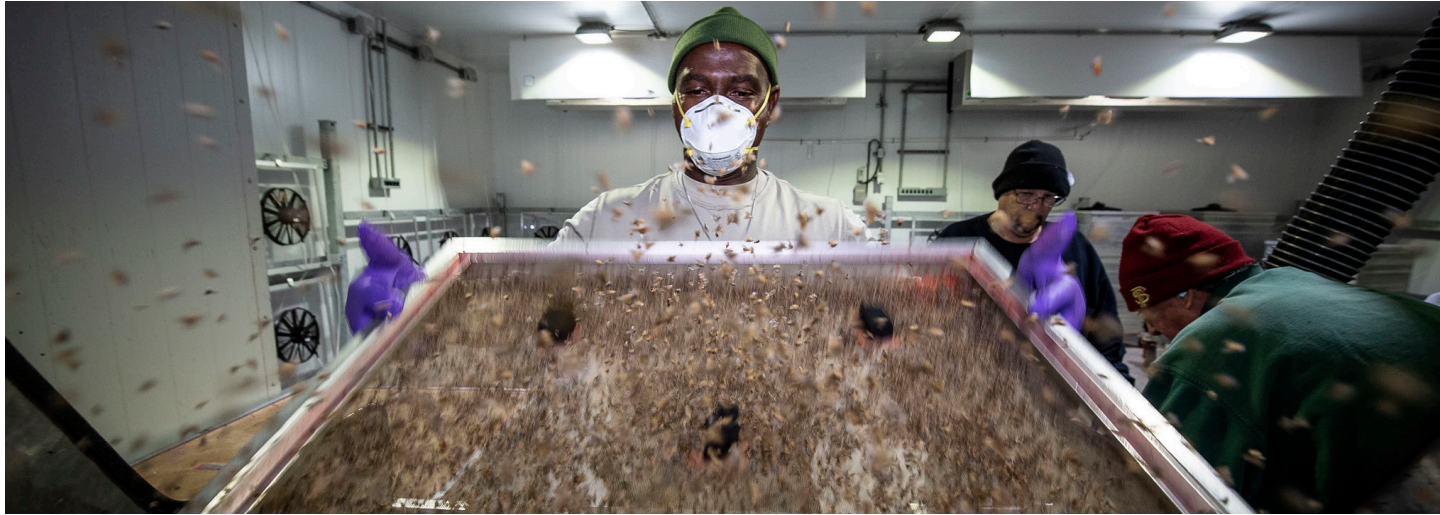
APHIS' Sterile Insect Rearing Facility, in Sarasota, Fla., where APHIS processes 100,000,000 sterile Mediterranean Fruit flies a week.

health) and wildlife damage to ensure that US farms and ranches remain healthy and productive.