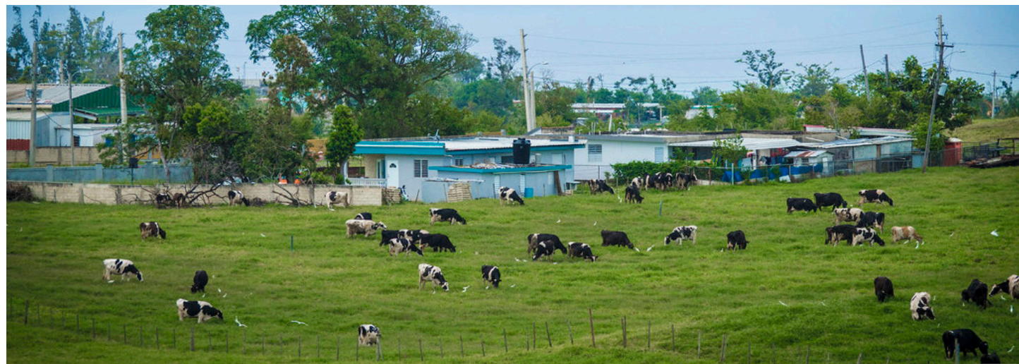
Vaqueria Ceiba Del Mar, in Arecibo, Puerto Rico, is one of the largest dairy producers on the island.

to help identify underserved communities and issues that APHIS would be able to help address.