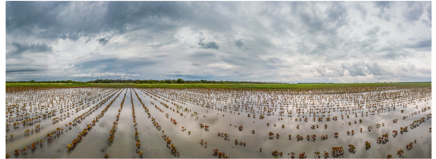
Aerial panorama of rain water that was added to cotton fields already saturated with days of heavy rain, during the past week in Bloomington, TX on June 3, 2021. Some of the plants have turned from a healthy green to stressed red color after prolonged suffocation/drowning under water.

In this section, we review these two vulnerabilities to describe the greatest risks or potential impacts of climate change that may impact APHIS' mission, programs, operations, and stakeholders.