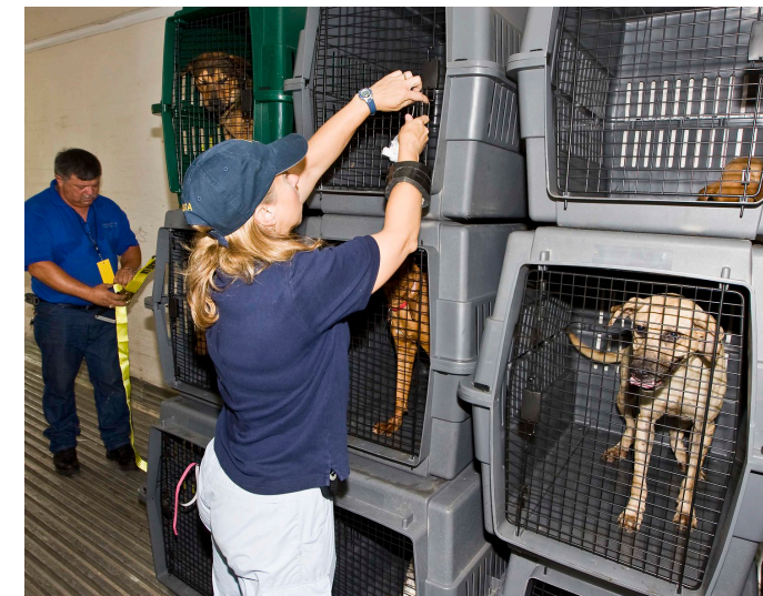
Animal safety and well-being during disasters is key to the safety and well-being of people.

Departments and Agencies and non-governmental organizations to coordinate Federal support for disasters exceeding the response capability and resources of the local, State, territorial, and Tribal governments. APHIS has established animal and plant health emergency frameworks to facilitate coordinated, timely responses to disease and pest emergencies. APHIS also has established frameworks to address all hazards (e.g., hurricanes, floods, wildfires) for impacts on plant and animal health and the needs of individuals with service animals and household pets, in addition to providing technical assistance for animal and agriculture emergency management. Climate change has the potential to overwhelm existing frameworks as a result of increases in extreme weather events, wildfires, and pest and disease outbreaks.