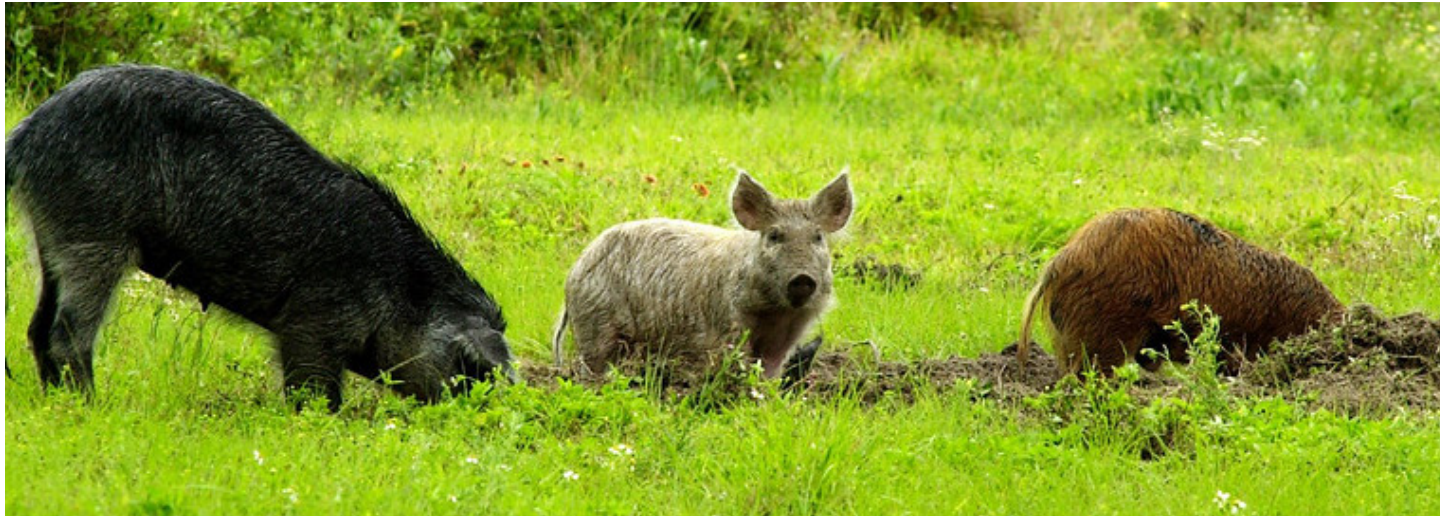
Feral swine rip and root their way across America in search of food impacting ranchers, farmers, land managers, conservationists, and suburbanites.

disease transmission among wildlife, livestock, and people (such as African swine fever, COVID19 and avian influenza). We expect increasing pandemics in the future when species expand and change their geographic locations and humans are available to host species that cause zoonotic diseases.