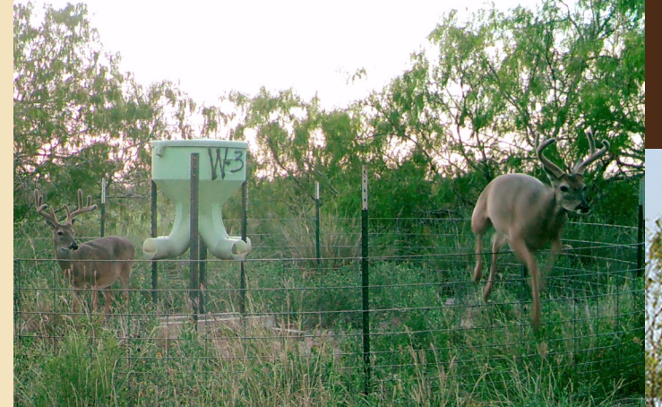
Deer at an ivermectin corn feeder.

Commonly called cattle fever, babesiosis causes cattle to lose weight, produce less milk, and even die. The disease caused enormous losses to the cattle industry in the past. Before the eradication program began, direct and indirect economic losses were estimated to be $130.5 million—more than $3 billion today. USDA and its partners worked together to eradicate the disease from the country by 1943, except for a permanent quarantine area along the Texas/ Mexico border, where the ticks that carry this disease are still found. Mexico continues to find babesiosis, so this buffer zone plays an important role in keeping ticks from spreading the disease back into the United States. USDA works closely with the Texas Animal Health Commission (TAHC) to carry out cattle fever tick eradication efforts. USDA and TAHC rely on research partners for livestock, wildlife, and environmental treatments, and for strategy and planning for future outbreak management. CFTEP research partners outside USDA APHIS and TAHC include the USDA Agricultural Research Service, Texas Agricultural Mechanical University, and Northern Arizona University.