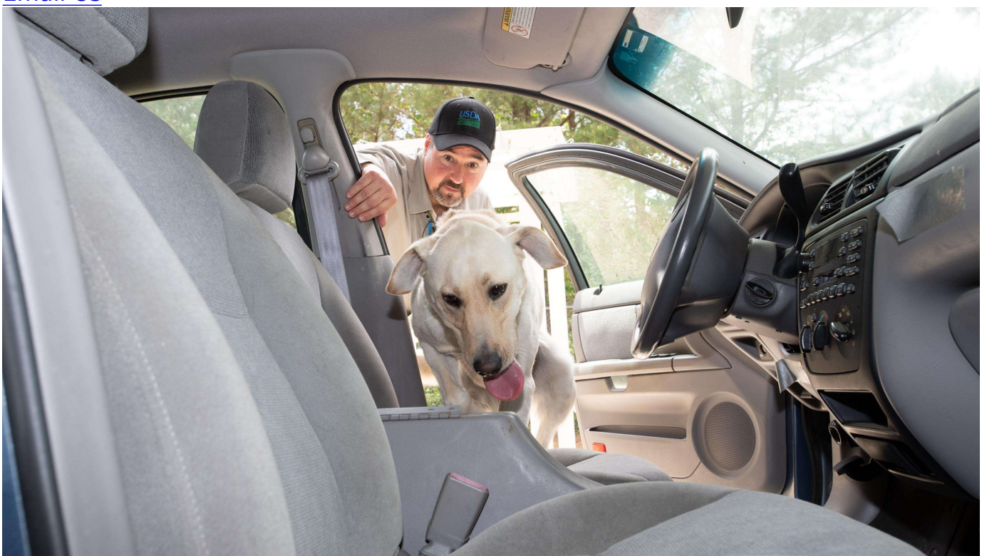
Want To Donate a Dog?

The Center accepts dogs from animal shelters, rescue groups, and private donations. Many of the dogs we bring into the program for training would have otherwise been euthanized. Contact us today to give a dog a second chance.