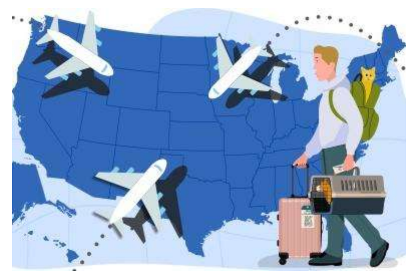
Take a Pet From One U.S. State or Territory to Another (Interstate)