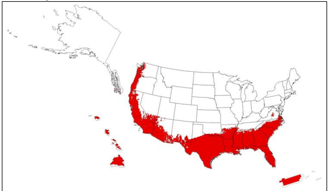
Figure 1. Predicted distribution of Hedychium gardnerianum in the United States. Map insets for Alaska, Hawaii, and Puerto Rico are not to scale.

Entry Potential We did not assess the entry potential of H. gardnerianum because this species is already present in the United States (PIER, 2011).