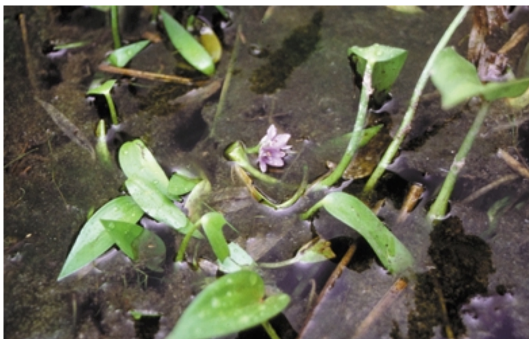
Monochoria Monochoria vaginalis