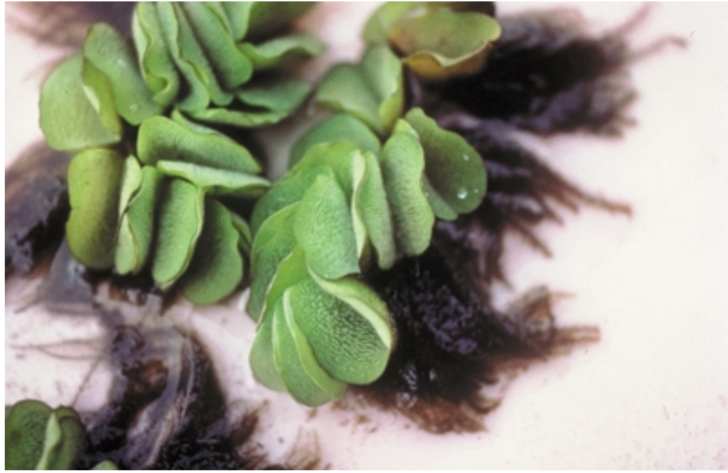
Giant salvinia Salvinia auriculata complex

For more information on the Federal Noxious Weeds List, including more aquatics, visit www.aphis.usda.gov/ppq/weeds/ on the World Wide Web.