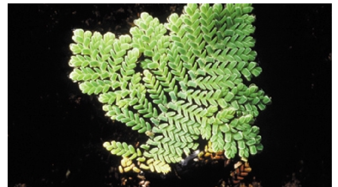
Pinnate mosquitofern Azolla pinnata