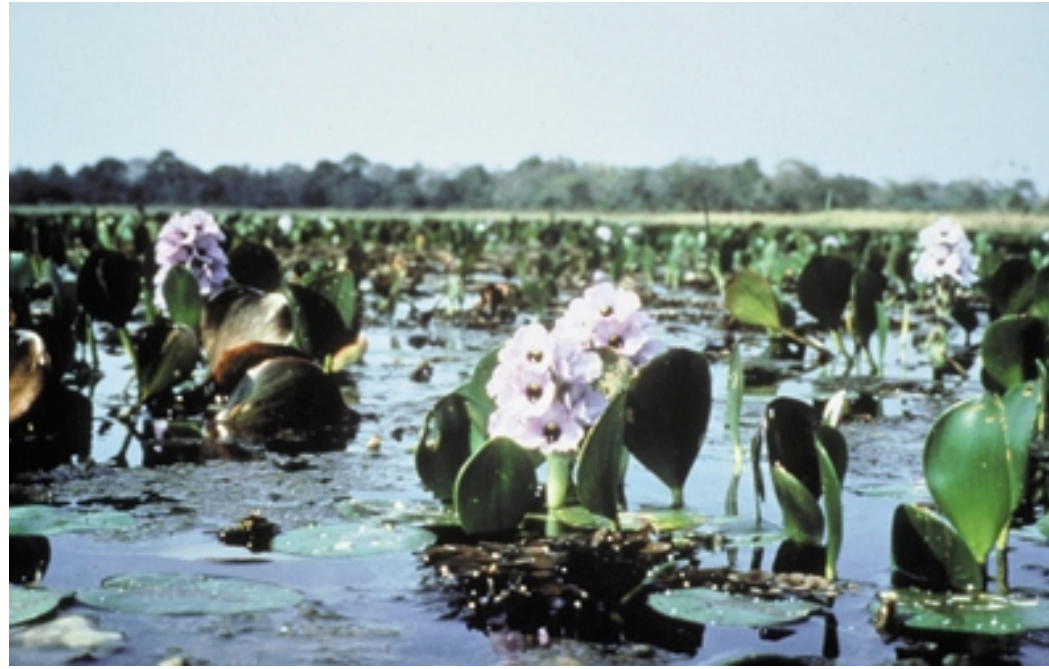
Anchored waterhyacinth Eichhornia azurea