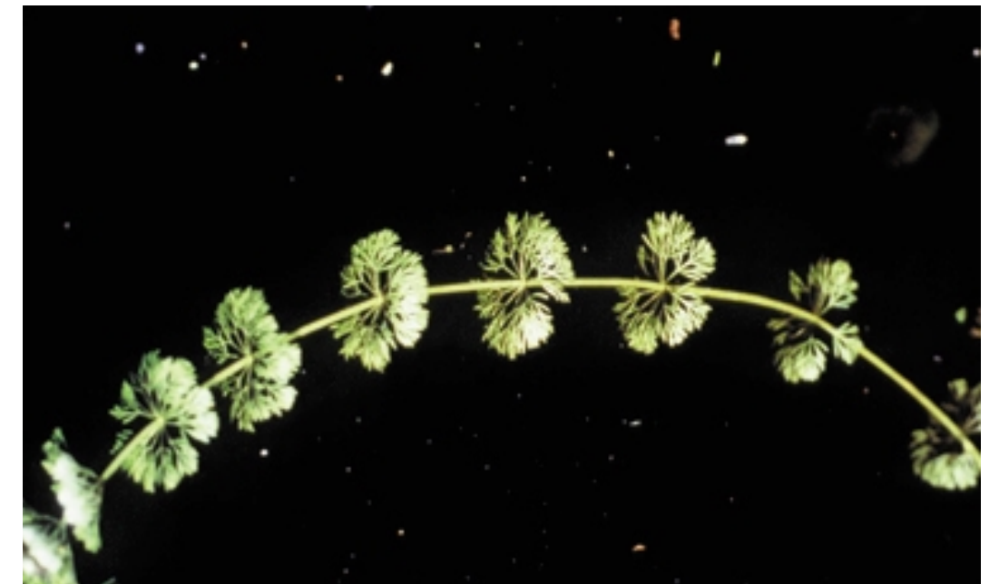
Limnophila Limnophila sessiliflora