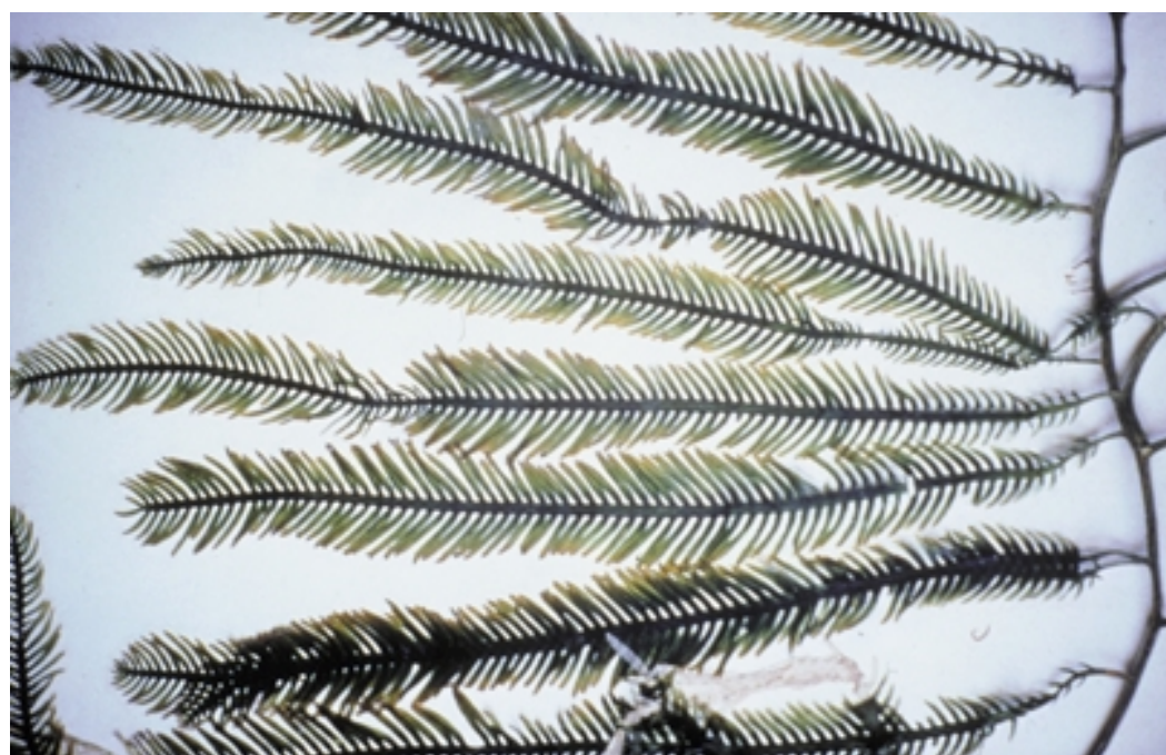
Caulerpa Caulerpa taxifolia