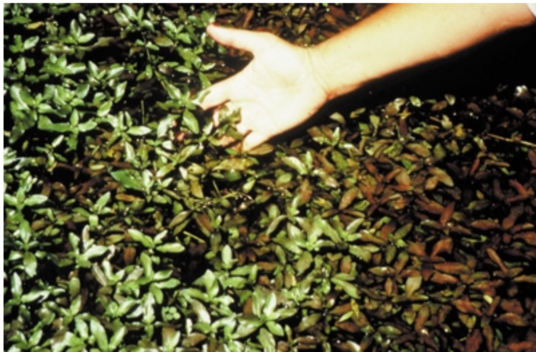
Indian hygrophila Hygrophila polysperma