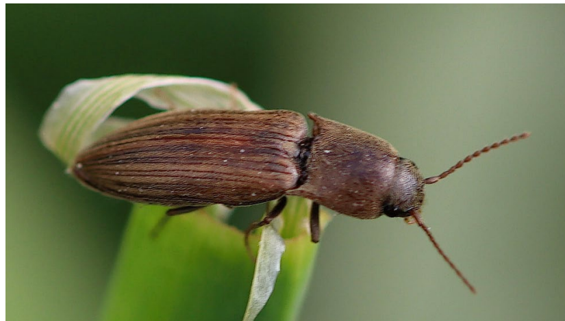
Agriotes lineatus (Lined Click Beetle)