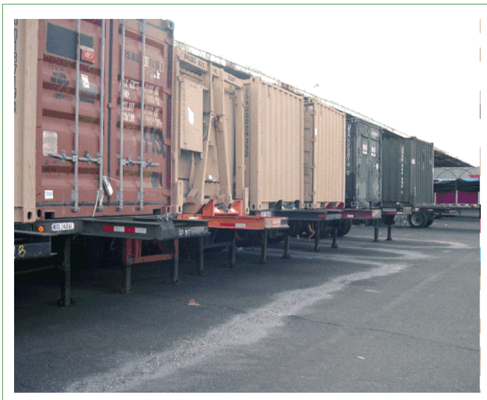
FIGURE 2-1-1: Salt Barrier Placed Around Containers to Prevent Snail Escape

See Figure 2-1-1 below for an example of a salt barrier placed around containers.