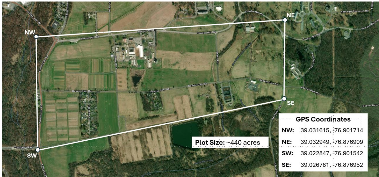
Figure 1. Use GPS coordinates to identify the Release location. You can submit coordinate pairs for a larger area than the Number of Acres you propose to plant to encompass the isolation distance to be monitored.