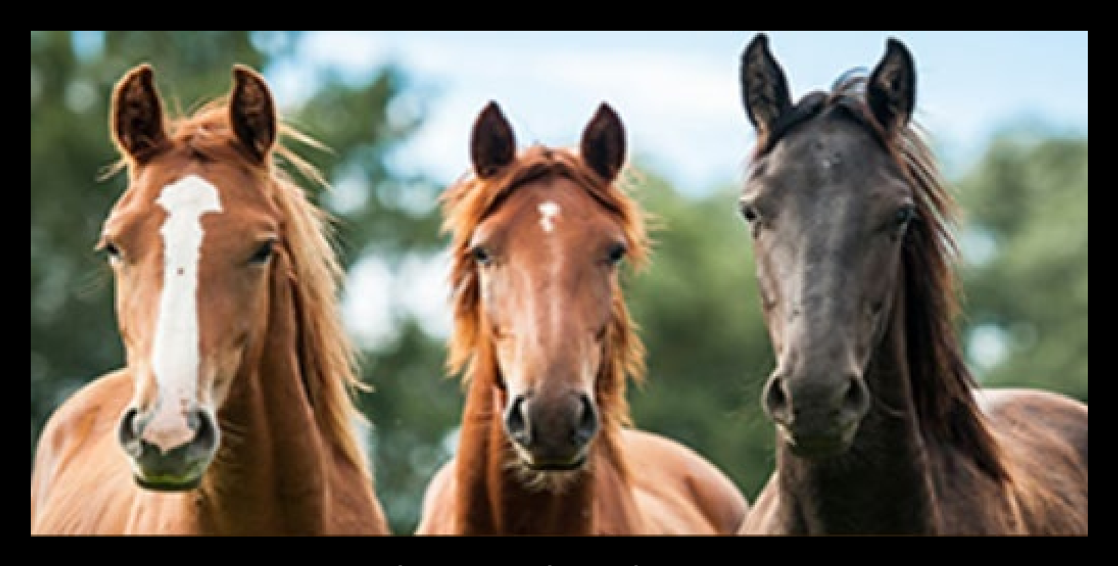
USDA | APHIS | VS | TRAINING