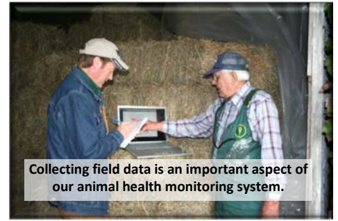
Collecting field data is an important aspect of our animal health monitoring system.

CEAH is a World Organization for Animal Health (OIE) Collaborating Center for Animal Disease Surveillance, Risk Analysis, and Epidemiological Modeling, and partners with OIE and member countries to improve international disease surveillance capabilities and analytic methods supporting trade decisions.