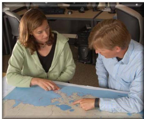
Geospatial analysis and mapping is an important service provide by CEAH to all of VS.