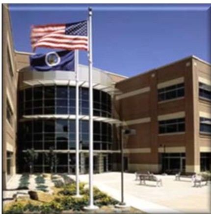
National Resources Research Center Fort Collins, Colorado

Advancing animal health around the world through epidemiology, science, and technology.