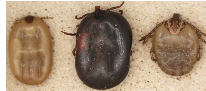
Figure 2. This figure shows various female ticks, including (from left to right) Rhipicephalus (Boophilus) spp. , a cattle fever tick; Dermacentor spp. ; and Amblyomma spp.