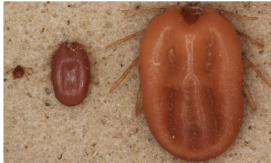
Figure 1. Three of the cattle fever tick's four life stages are (from left to right): larva (six-legged and looks like a small black dot), nymph, and adult. Nymphs and adults are eight-legged.

Cattle fever is caused by either of two protozoan blood parasites carried by cattle fever ticks. The parasites, called Babesia bigemina and Babesia bovis , infect, reproduce in, and eventually rupture an infected animal's red blood cells, releasing the parasites and hemoglobin into the animal's bloodstream. This results in anemia and lowered oxygen levels in the blood, which can cause lowered milk production, weight loss, increased respiratory rate, and death. In addition, infected animals sometimes have red-colored urine because of the hemoglobin the kidneys filter out of the blood. This is why the disease is also called "red water."