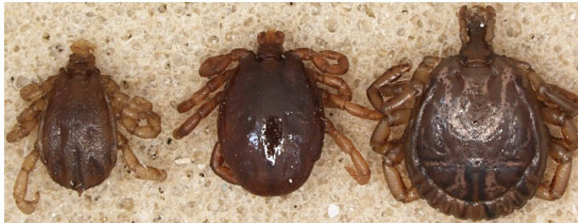
Figure 3. This photo shows various male ticks, including (from left to right) Rhipicephalus (Boophilus) spp. , a cattle fever tick; Dermacentor spp. ; and Amblyomma spp.