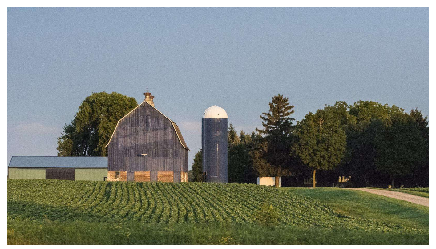
Protecting Natural Resources

WS' operational activities to protect natural resources include threatened and endangered species protection; managing wildlife species such as blackbirds, vultures, and waterfowl; invasive species management; and wildlife rabies management.