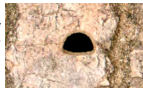
D-Shaped Emergence Hole