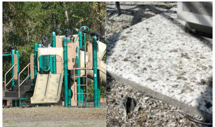
Figure 6. Fecal material from vulture roosting and loafing can render facilities such as playgrounds unsafe and unappealing. Fecal accumulation, feathers, and regurgitated pellets signify presence of a vulture roost.