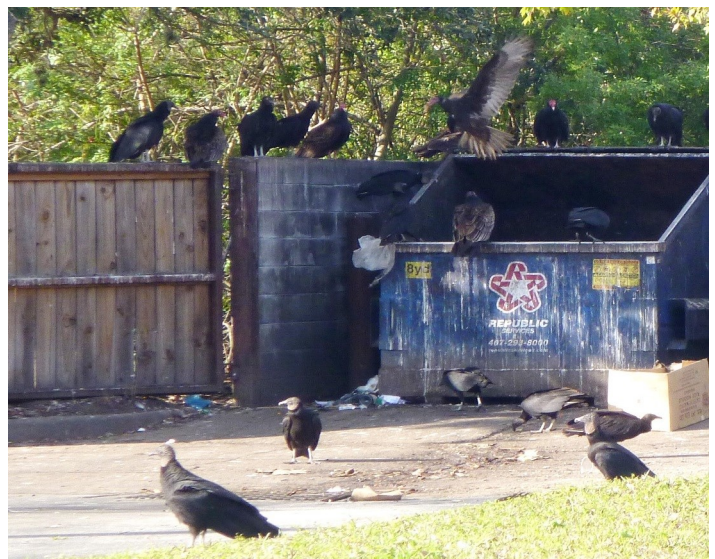
Figure 17. Vultures exploit feeding opportunities created by human activity.

On a smaller scale, black vultures often plunder dumpsters and garbage cans, and they frequent waste transfer stations, zoos, and any place where food scraps are regularly available (Figure 17). Both species are adaptable and capable of exploiting feeding opportunities created by human activity.