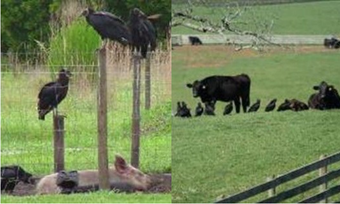
Figure 2. Livestock producers must be vigilant because black vultures are known to kill and injure vulnerable animals, especially newborns and those giving birth.

appropriate, and experience has shown that best results are obtained if the source roost can be dispersed.