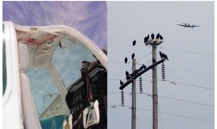
Figure 5. Vultures represent major safety hazards to civil and military aircraft.