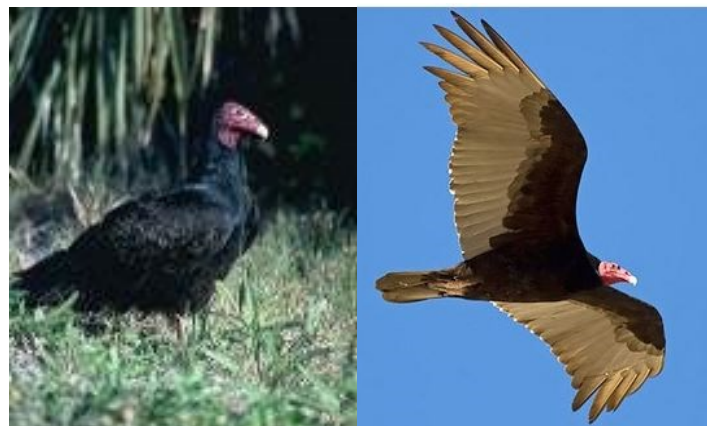
Figure 12. Turkey vultures ( Cathartes aura ) are characterized by long, narrow wings, a relatively long tail, and a red head (in adults).

and glide when at low altitudes, whereas black vultures flap frequently, interspersed with brief glides when at low altitudes unless a strong wind blows. At high altitudes both vultures primarily glide when riding thermal wind currents.