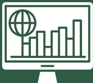
Monitoring and Trends