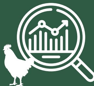
Domestic Animal Disease Mitigation