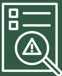
Foreign Animal Disease (FAD) Prevention/ Mitigation