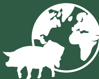
Foreign Animal Disease (FAD) Response Planning and Implementation