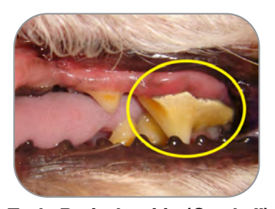
Early Periodontitis (Grade II)

Gums: mild redness Teeth: mild tartar, no loose or missing teeth