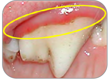
Gingivitis (Grade I)

Gums: normal, healthy Teeth: no tartar, no loose or missing teeth